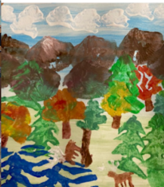
Cedar Grade 1 Printmaking Art