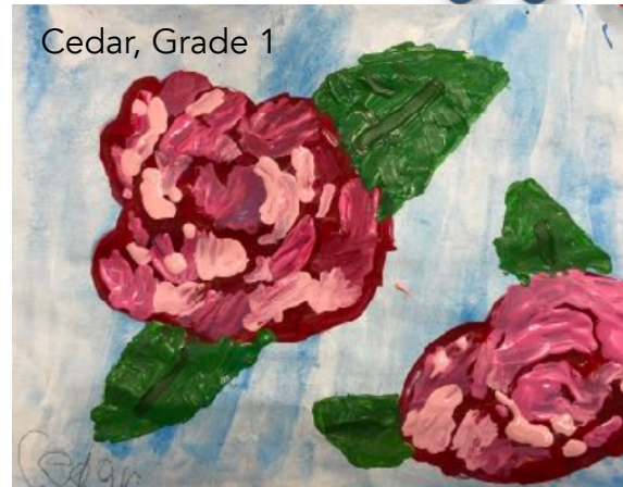
Cedar, Grade 1