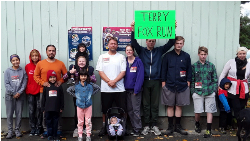
Bella Coola Students, Terry Fox Run