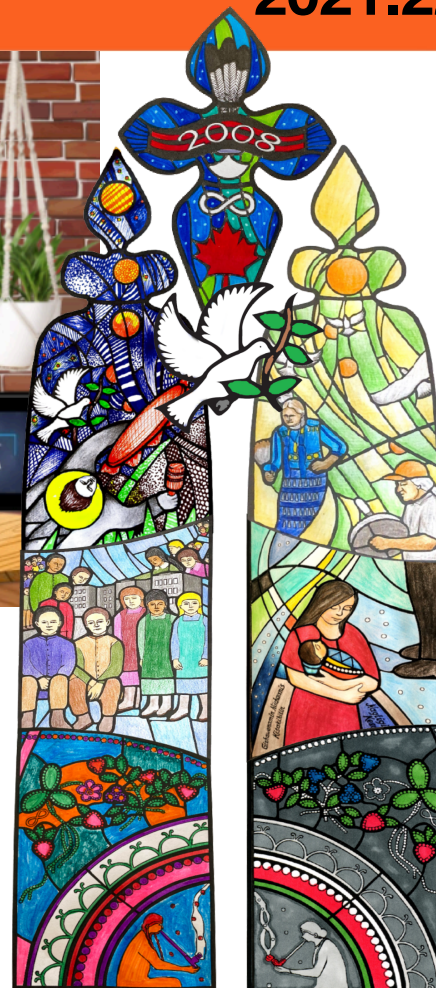
West Coast Staff Truth & Reconciliation Stained Glass Window