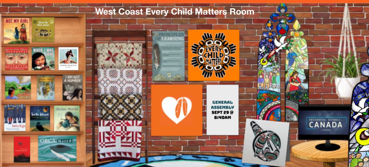
West Coast Every Child Matters Room

Thanks to all students, staff, and parents who participated in our Truth & Reconciliation Week 21/22. It was a great learning experience! You can visit the resources laid out in the Every Child Matters room any time, and continue to do the activities at your discretion throughout the year: