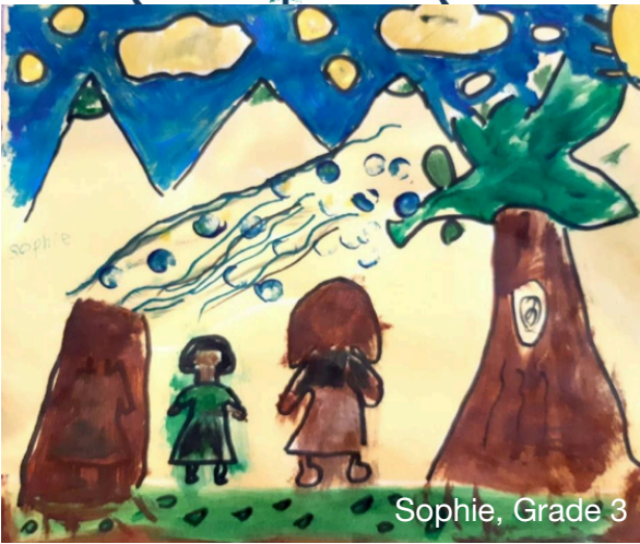
Sophie, Grade 3