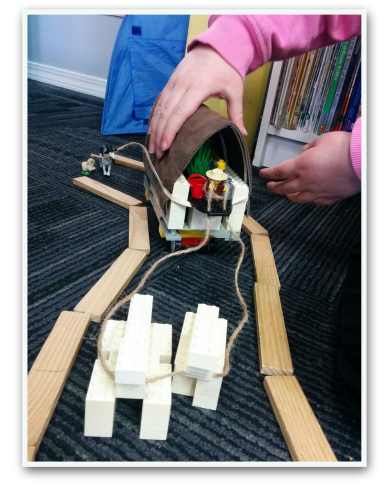
Maya & Bryleigh, Grade 1, Covered wagon and trail for their Pioneer Unit in Social Studies.