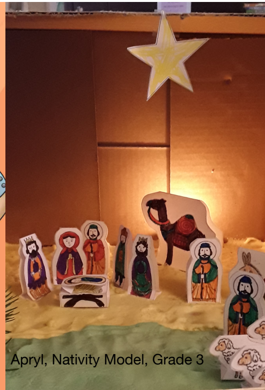
Apryl, Nativity Model, Grade 3