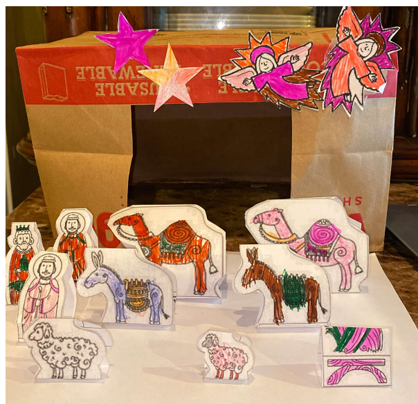
Blakley, 3-D Model of Community, Grade 1