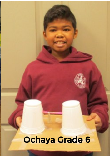
Ochaya Grade 6