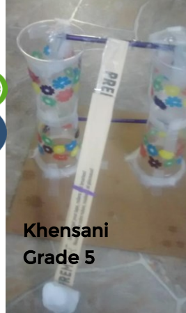
Khensani Grade 5